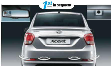
REAR PARKING ASSIST SYSTEM Visual display on the Electro-chromic Rearview Mirror to park the car perfectly

With Hyundai, safety always comes first and the Xcent is no exception. Be it passive safety like dual airbags, use of anti-corrosive steel, special welding techniques to enhance body robustness, ring structure to enhance rigidity or active safety elements like ABS, reverse parking sensors and reverse parking camera with ECM display, the Xcent is designed to keep your family safe.