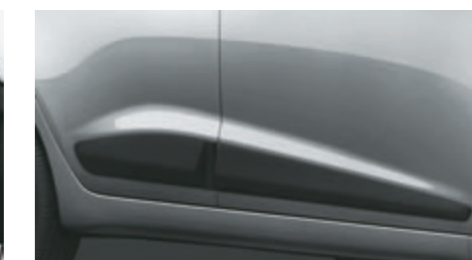
WAISTLINE MOULDING Imparts a sporty look and prevents scratches to the body