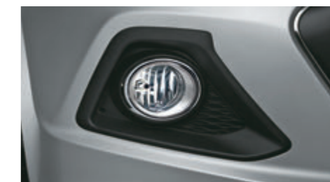
FOG LAMPS Designed for optimum amplification and to ensure safety during foggy weather conditions