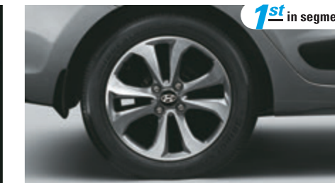
R15 DIAMOND CUT ALLOY WHEELS With 2-tone black and chrome finish for a sporty and dynamic appeal