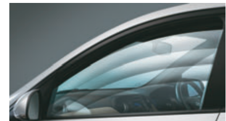
POWER WINDOWS Ergonomically located switches on the door armrest aid in easy operation of windows