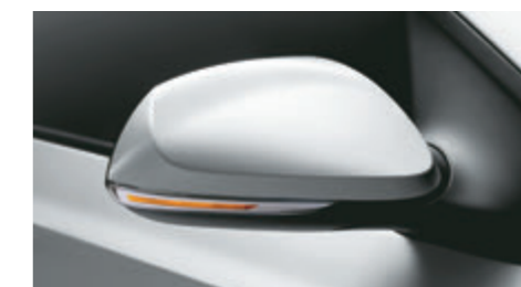
OUTSIDE MIRROR WITH TURN INDICATOR Aerodynamically designed to enhance looks and safety