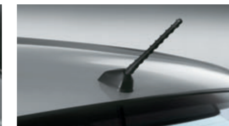
MICRO ROOF ANTENNA For efficient radio connectivity and aesthetic appeal