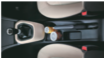
FLOOR CONSOLE STORAGE Cup holder and 1 ltr. bottle holder for storing water and beverages while driving

Expect the unexpected from Hyundai when it comes to product features. Loads of segment unique and hi-tech features offer limitless comfort and make your journey an unforgettable experience.