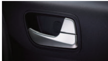
IMPACT SENSING AUTO DOOR UNLOCK To allow safe and quick exit in case of collision