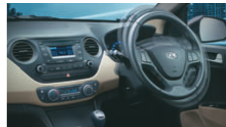
TILT STEERING Allows driver to adjust steering as per his/her convenience