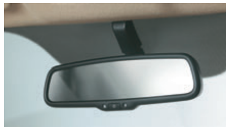
ELECTRO-CHROMIC MIRROR Automatically senses and reduces glare and light intrusion from vehicles following the car