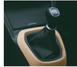
5-SPEED MANUAL TRANSMISSION Available in both petrol and diesel variants for smooth and accurate gear shift

The Hyundai Xcent offers an exciting blend of performance and efficiency with the 1.1 U2 diesel engine and the highly acclaimed 1.2 Kappa Dual VTVT petrol engine. Both the engines are mated with 5-speed manual gear boxes while the 1.2 Kappa petrol engine also offers the option of a 4-speed automatic transmission.