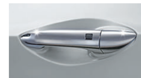
CHROME DOOR HANDLE Adds a premium look to the overall profile of the car