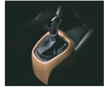
4-SPEED AUTOMATIC TRANSMISSION Available in petrol variant for driving in traffic with ease