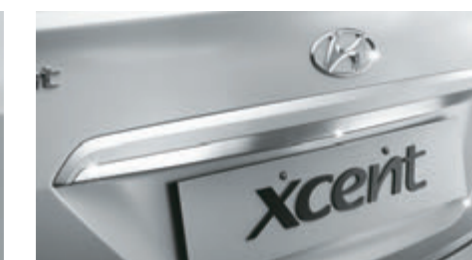
REAR CHROME GARNISH Highlights the rear profile of the car