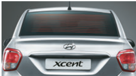
REAR DEFOGGER Ensure proper visibility during foggy or rainy weather