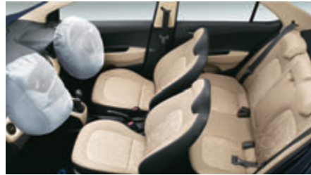
DUAL AIRBAGS Ensures protection to occupants in the event of frontal impact