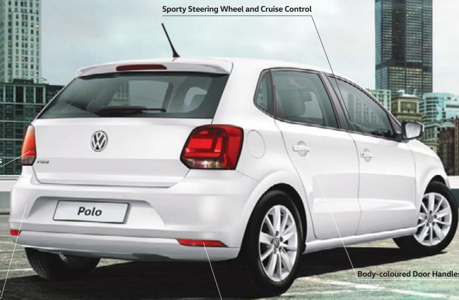
Sporty Steering Wheel and Cruise Control