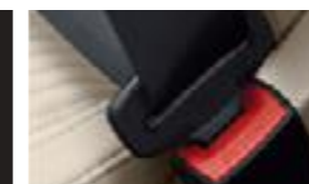
3-point Seat Belts