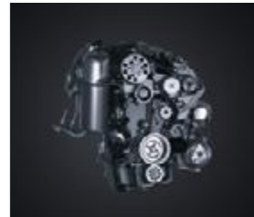
1.2L MPI Petrol Engine