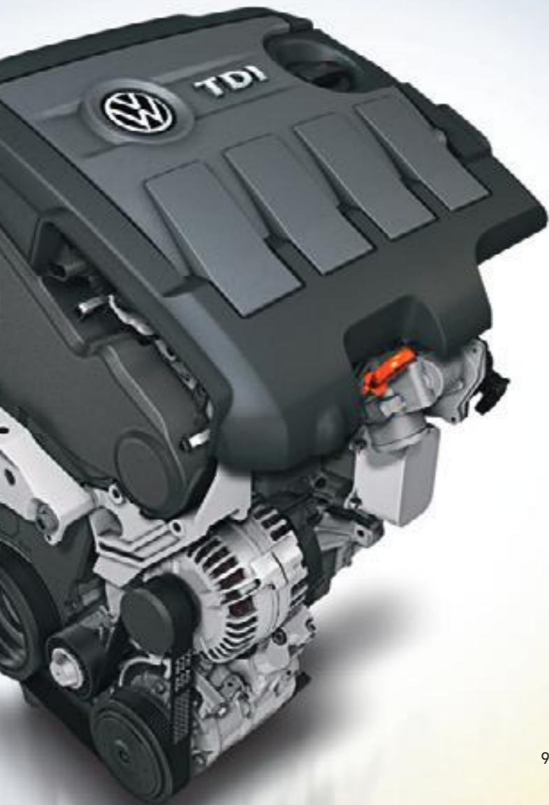
1.5L TDI Engine 90PS (66kW) Power 230 Nm Torque