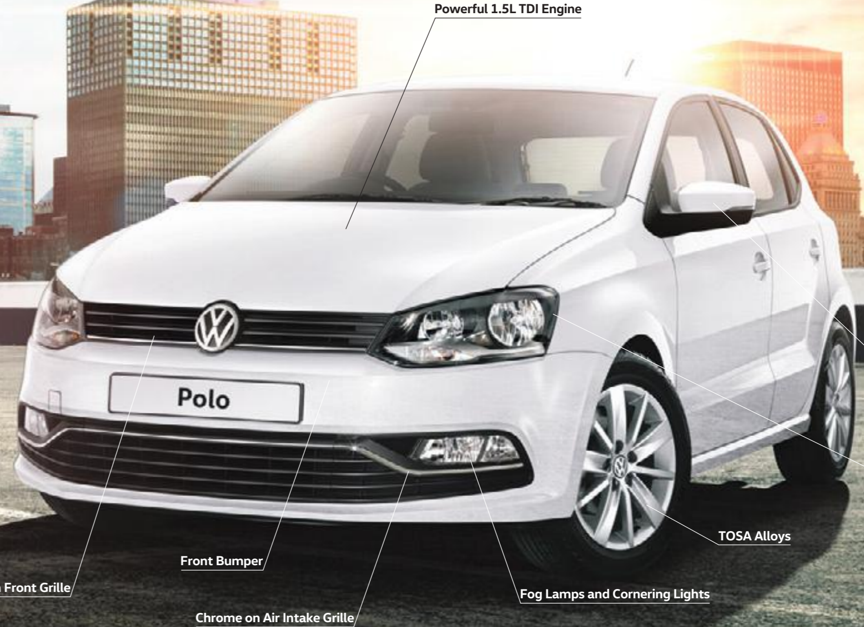
Powerful 1.5L TDI Engine