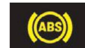
Anti-lock Braking System (ABS)

Rated the Safest Premium Hatchback in its Segment in India