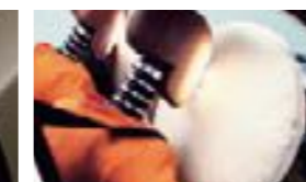
Dual-front Airbags as Standard