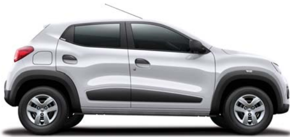
ICE COOL WHITE