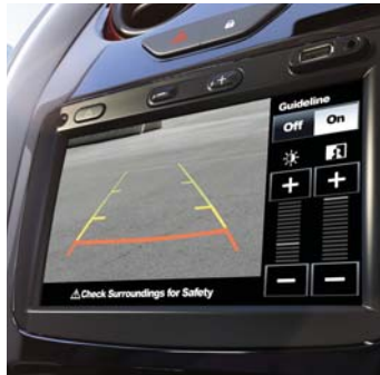
Reverse parking camera with guidelines