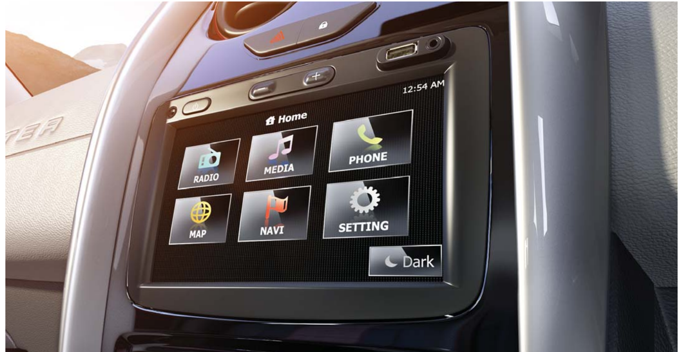
Touchscreen infotainment system

The first-in-class MediaNAV ensures an entertaining and relaxed drive. The touchscreen infotainment display features radio, USB and Aux-in connectivity and GPS navigation as well. The MediaNAV also eases your driving experience by enabling hands-free calling. Now wherever you go, stay connected.