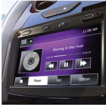
Dynamic multimedia player