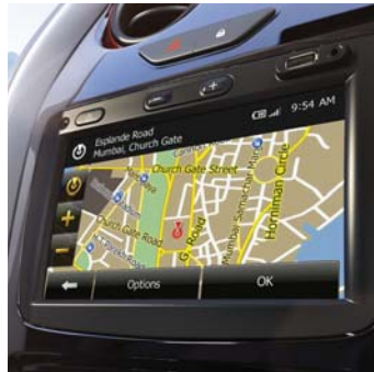
GPS satellite navigation