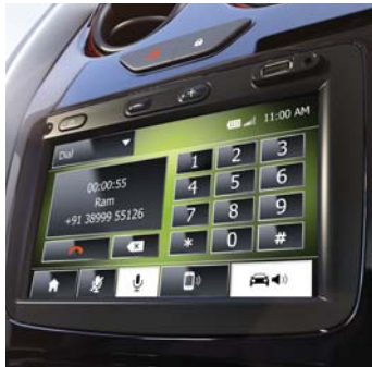
Phone control via Bluetooth®