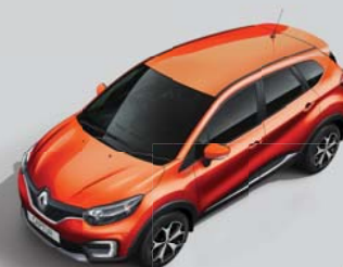
CAYENNE ORANGE BODY & ROOF