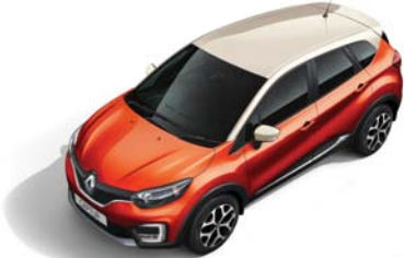
CAYENNE ORANGE BODY WITH MARBLE IVORY ROOF