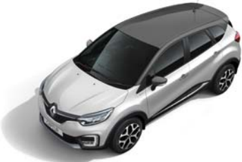
PEARL WHITE BODY WITH PLANET GREY ROOF