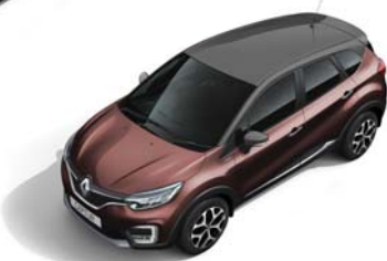
MAHOGANY BROWN BODY WITH PLANET GREY ROOF