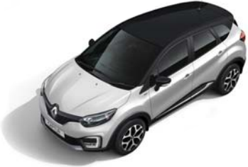
PEARL WHITE BODY WITH MYSTERY BLACK ROOF