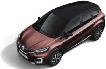
MAHOGANY BROWN BODY WITH MYSTERY BLACK ROOF