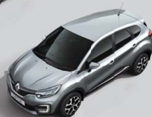
MOONLIGHT SILVER BODY & ROOF