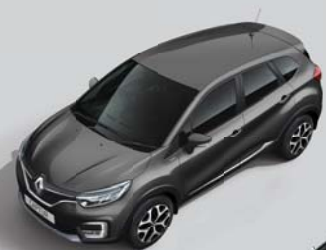
PLANET GREY BODY & ROOF