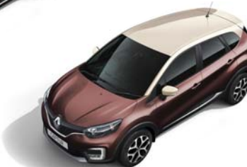
MAHOGANY BROWN BODY WITH MARBLE IVORY ROOF