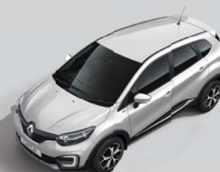
PEARL WHITE BODY & ROOF