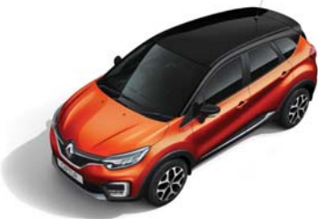
CAYENNE ORANGE BODY WITH MYSTERY BLACK ROOF