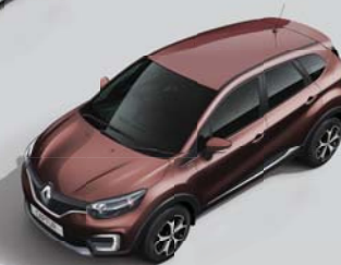
MAHOGANY BROWN BODY & ROOF