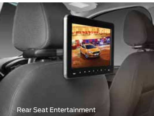
Rear Seat Entertainment