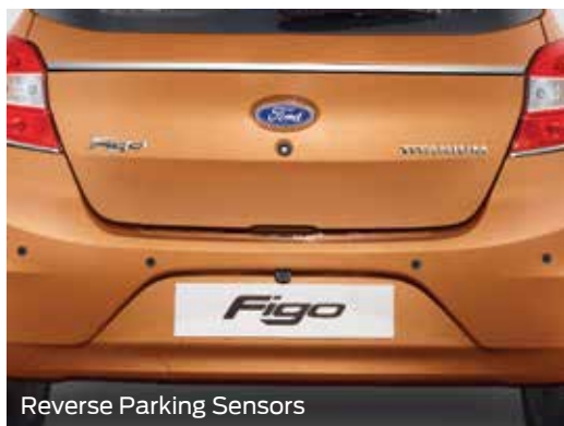
Reverse Parking Sensors