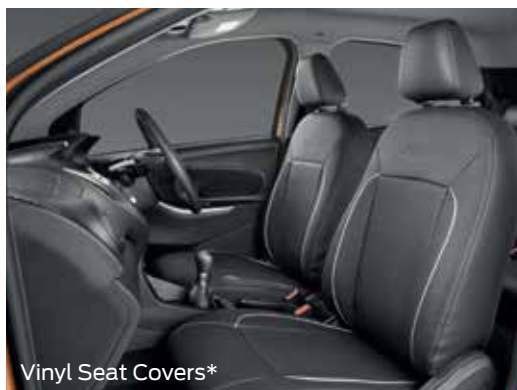
Vinyl Seat Covers*