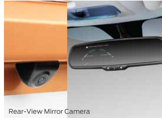
Rear-View Mirror Camera