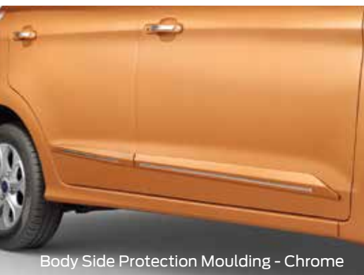
Body Side Protection Moulding - Chrome