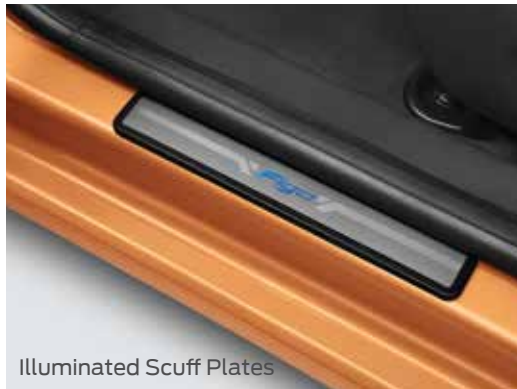
Illuminated Scuff Plates