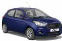
Deep Impact Blue