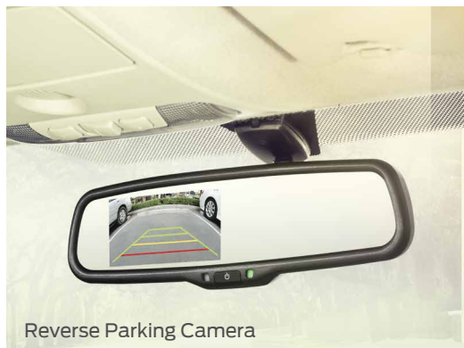
Reverse Parking Camera