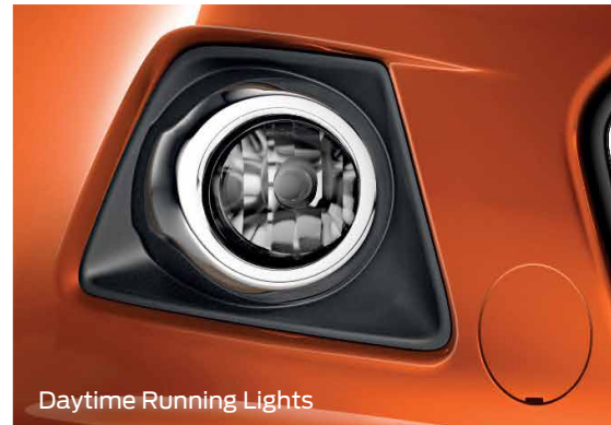
Daytime Running Lights