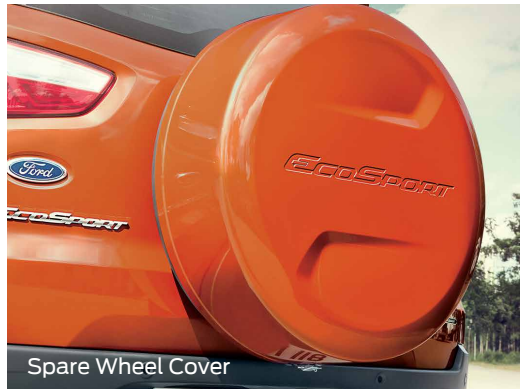
Spare Wheel Cover