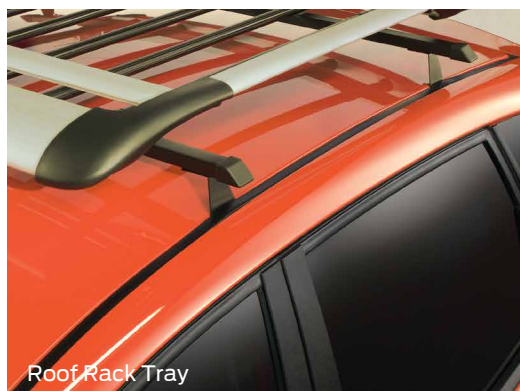
Roof Rack Tray